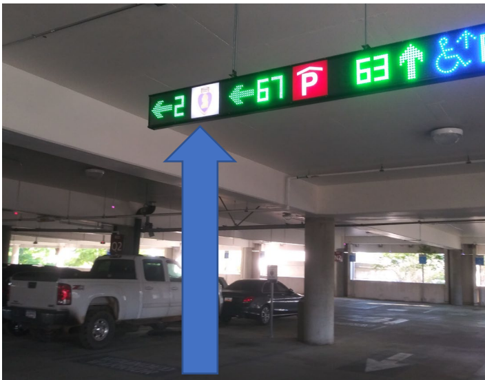
The Wounded Warrior symbol and count on the end of this LED sign shows available spaces